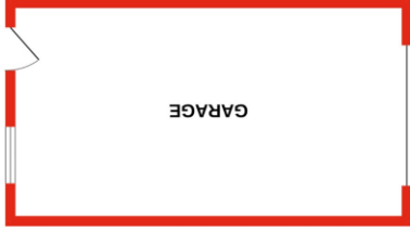
GROUND FLOOR 910 sq.ft. (84.5 sq.m.) approx.

A professional removal company takes the stress out of moving, knowing that your belongings are safe and insured far outweighs any small savings by trying to do it yourself or using a man-and-a-van service. We work closely with and recommend Cube Removals as the leading local firm. For peace of mind and a reliable service call them on 0800 193 0000 or visit their website, cuberemovals.co.uk , to arrange a survey.